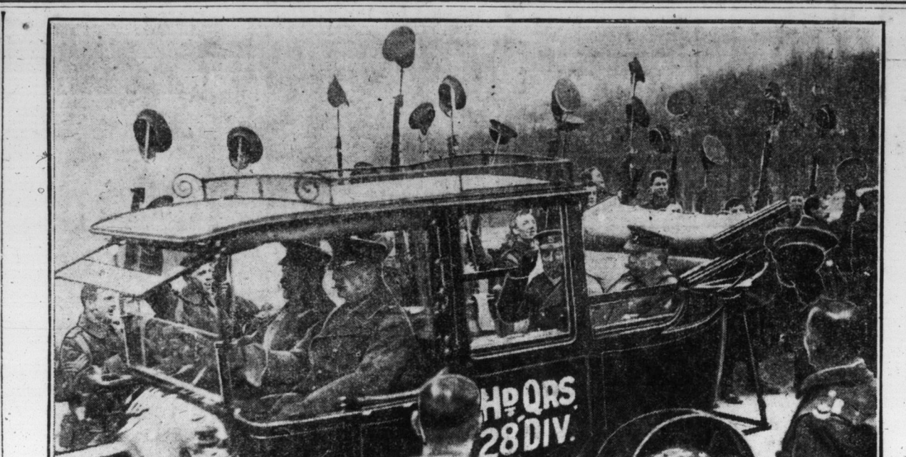
The King, Accompanied by Lord Kitchener, Inspects Troops at Winchester.

ments. Breast of Mutton .- Remove the These answers to the child's prattle, says the letter, were given with dry eyes and unemotional voice. The mother was past all emotion, and there were no more tears. "But, mamma, why do they kill each other?" "We solid I do not know" "The property of the cooking proceed very briskly for an hour. At the end of that time lift out the "The point of the cooking proceed very briskly for an hour. At the end of that time lift out the "The point of the cooking probreast and spread it on a chopping board. As soon as it is cool enough to handle remove all the bones.