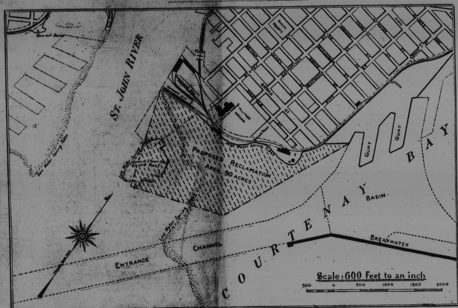
HOW ST. JOHN CAN MEET THE SITUATION.