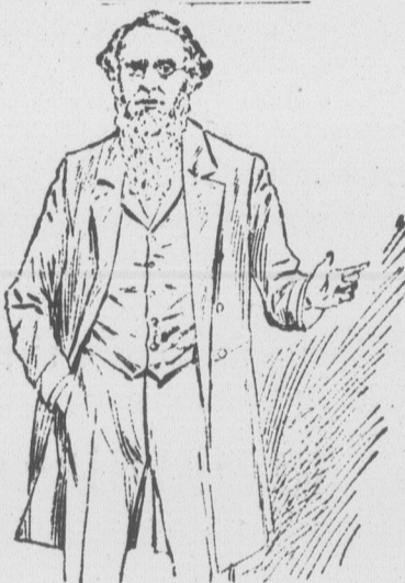
DR. A. W. CHASE LECTURING AT ANN ARBOR, MICH.

The commissioner of agriculture received advices today of the sale of trial shipments on Ontario fattened poultry sent from St. John to Liverpool about a month ago. The birds met a ready sale in Liverpool at 16 cents per pound, wholesale. The chickens were sent plucked but not drawn, and weighed an average of 5 1-2 pounds each. The wholesale price therefore was equal to $1.76 per pair. The chickens when put up to fatten were worth 50 cents per pair. The food consumed per pair during the fattening cost 31 cents, making a total cost of 81 cents per pair, without allowing anything for the labor of attending them. The packing cases cost at the rate of three cents per pair, and the transportation and selling charges would cost, in the usual course of business for such chickens, not more than 22 cents per pair, a total of $1.06, leaving 70 cents per pair for the labor and profit.