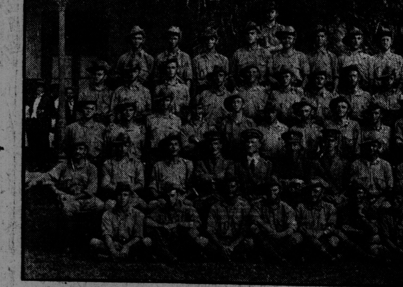
This is a second contingent of Fiji Island soldiers now in Montreal and some time to go to join Kitchener's army.

London, Aug. 7.—The reconstruction of the Balkan League, the key of which is Bulgaria, and its co-operation with the allies would far outweigh in importance the loss of Warsaw, and would materially hasten the defeat of the Germanic powers, says the Daily News.