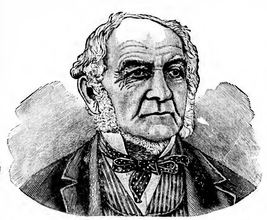
Hon. W. E. Gladstone.