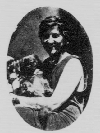
Her mirth the world required, She bathed it in smiles of glee.