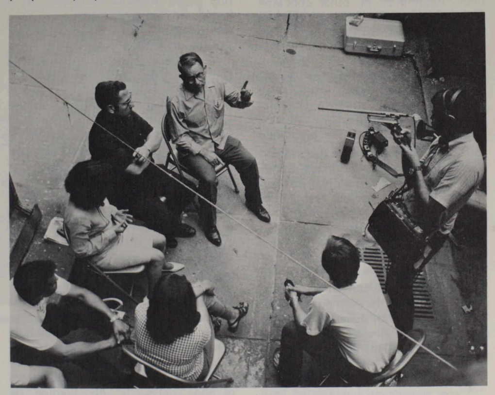
In Hartford, Conn: "records of a community talking."

All elements of the community are able to see each other mirrored on film and thereby gain fresh insight and understanding of their fellow citizens, their problems and strengths, and to