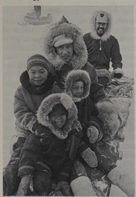
Prime Minister Trudeau and Eskimo children: "for the protection of every human being."

Against this backdrop, the Canadian Government introduced into Parliament on April 8 legislation asserting its right to control pollution one hundred miles out from the mainland and islands of the Canadian Arctic. In an exceptional display of parliamentary unanimity (a vote of 198-0), it has been given second reading or approval in principle. Third reading, which is tantamount to enactment, is expected before the end of the present session of Parliament.