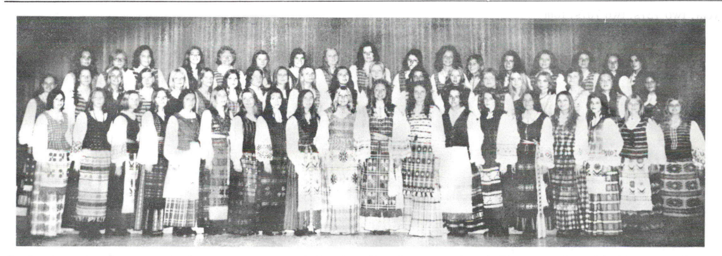
Posing in national costume is the 'Aidas' Canadian Lithuanian Girls' Choir from Hamilton, Ontario. The group will arrive in Britain on August 16, for a European tour and will give

The CF-5 went into service as the replacement for the T-33 on July 26.