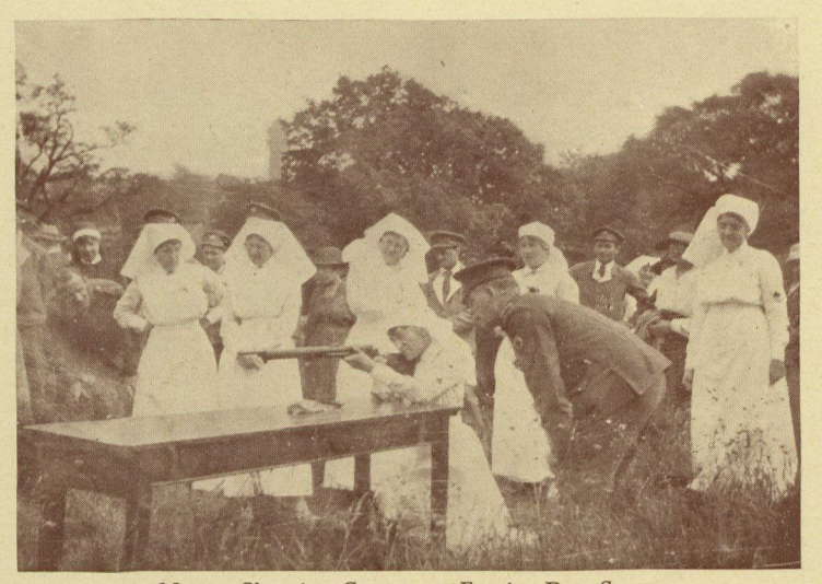
Nurses Shooting Contest at Empire Day Sports.