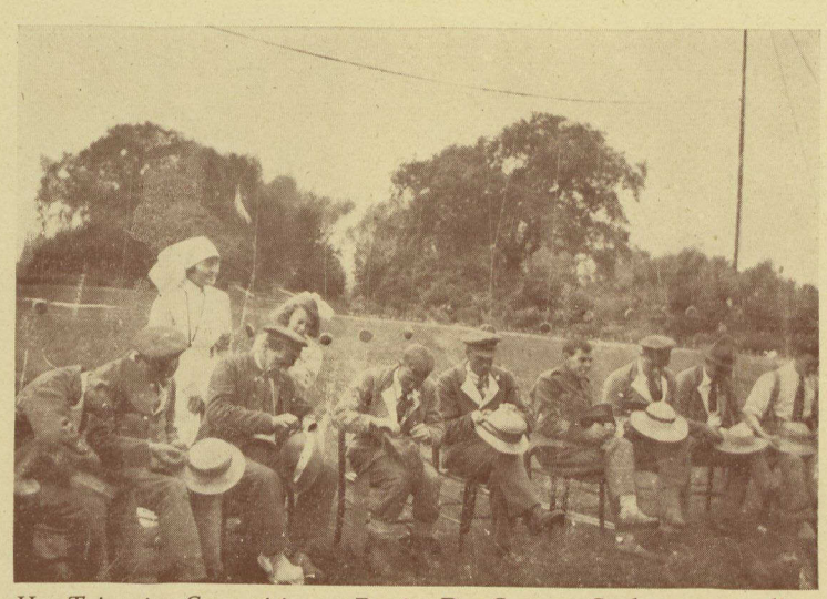
Hat Trimming Competition at Empire Day Sports. Cords are suspending Buns ready for Bun Eating Competition.