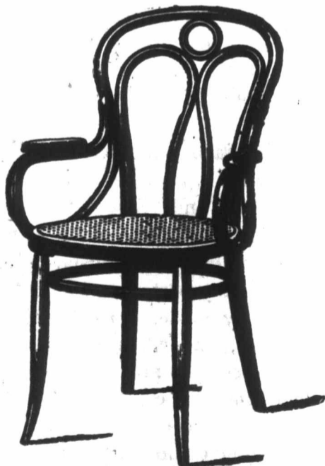
"Patent Kohn." Nr. 36 1/2.

Full range of the Celebrated Austrian Bentwood Furniture.