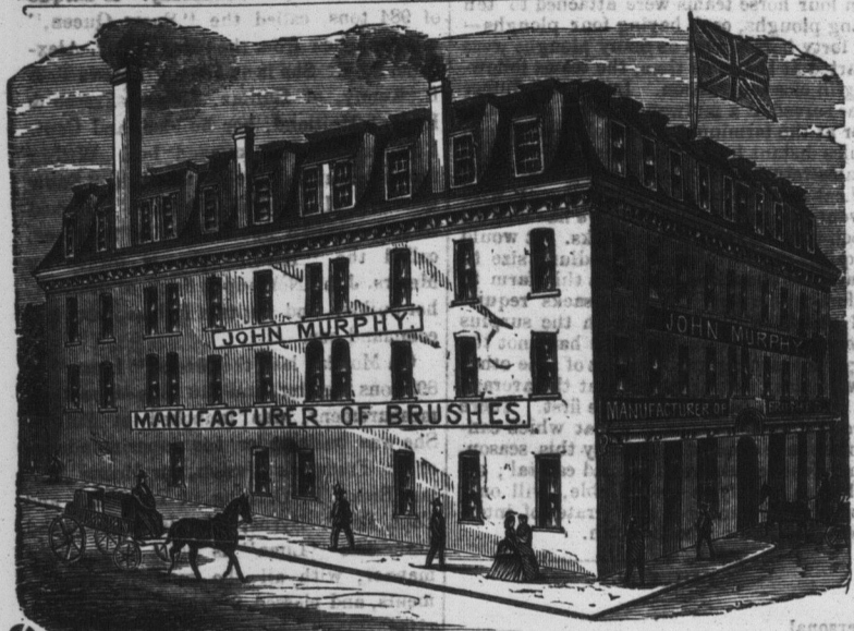
DOMINION STEAM BRUSH FACTORY NOW MANUFACTURING KATAKATA PAINTS, KATAKATA WATERWASH, PAPER, LEATHER, HORSE, and all descriptions of PAINT, WATERWASH, and SCRUB BRUSHES.

FACTORY and OFFICE, Union corner Carmarthen Street, ST. JOHN, N. B.