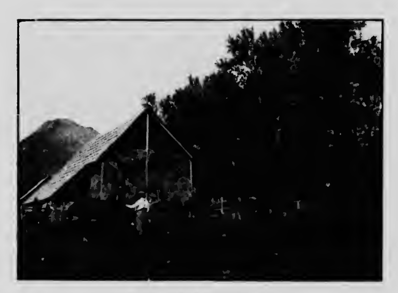
Corner of Ranch, Pemberton Meadows.