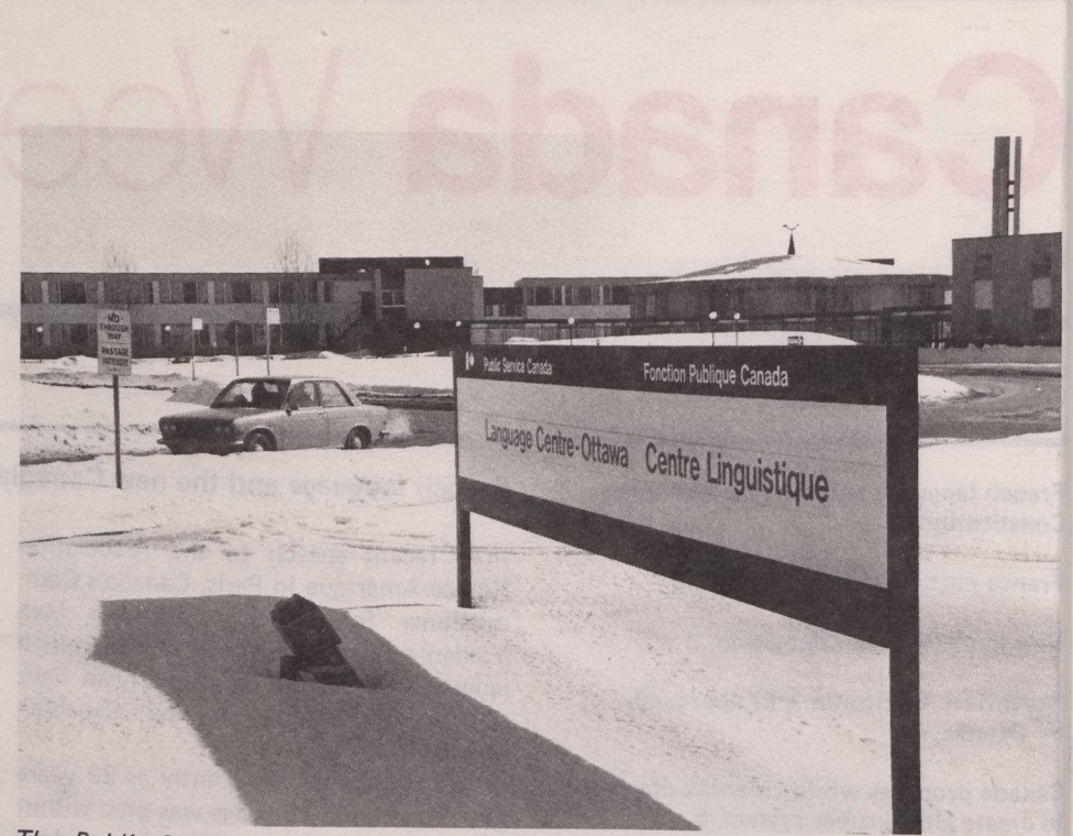
The Public Service Language Centre of Canada, in Ottawa, where federal employees improve their knowledge of their second official language.

While the declaration of equal rights for official languages and its implications for legislature, courts and government services pose few ambiguities, the Charter is far less clear in its provisions relating to language rights in the educational field. However, the process of defining these