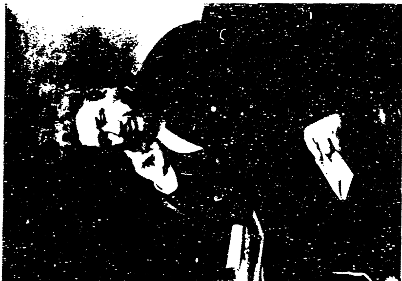
CHARLES HADDON SPURGEON.