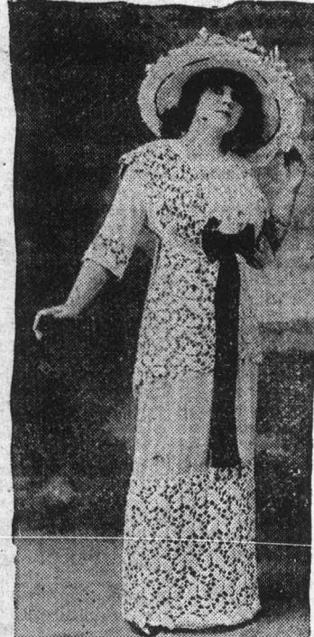
GOWN OF CROCHET LACE AND SATIN.

The sash may be anywhere on the gown this summer-around the waist around the knees, at back or front of on either side. This smart frock of crochet lace and cream satin meteor is