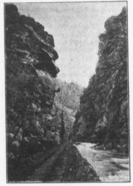
CLEAR CREEK CANYON On the Loop Trip, Colorado,

HIS is the most popular excursion in Colorado, and and doubtless the most wonderful one-day trip on this continent. The trip covers 110 miles, Denver to Silver Plume and return, and takes you through the beautiful Clear Creek Canon, past the cities of Golden, Idaho Springs