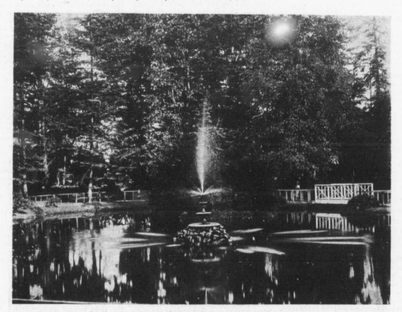
THE FOUNTAIN IN THE PUBLIC PARK, VICTORIA, B.C.

nerve-racking, life-lunting clang and clamor. For the monce, anyway, he will part with this all cheerfully, enjoying the wide quiet streets, the noble reaches of the parks, the sweep of the sea, the vastness of the cedar forests, the splendid silence of a great battleship swinging gently at its anchor. To be sure, the streets can send up the noise of traffic, and the forests can fall at the call of the axe, and the sea can roar and the battleship boom, but these are not nor malities. Victoria and its environs is pre-eminently a beautiful, quiet, restful place. Would there were more such cities in America, havens of refuge for those beset by the flends of noise!