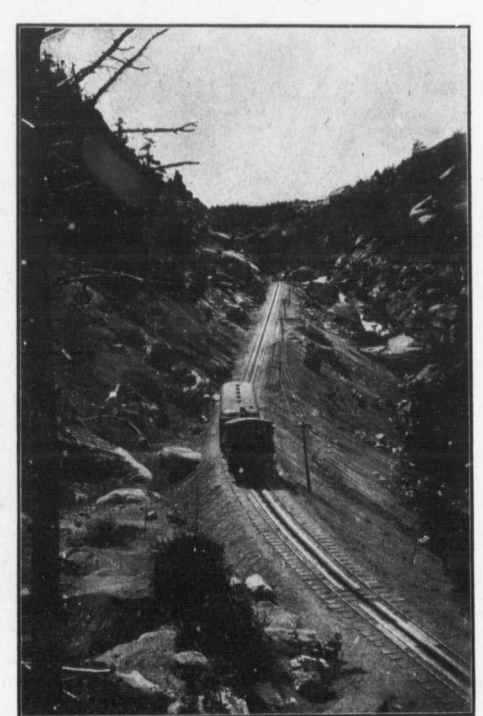
UP PIKE'S PEAK

area. This is not because it is the highest mountain peak for there are others in Colorado that are higher, but because it rises to its great height abruptly from the plains. The field of vision includes an area of 50,000 square miles. To the south are the Spanish Peaks, in New Mexico, 150 miles distant. To the west is the Sangre de Christo Range, lifting