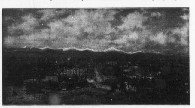
BIRD'S-EYE VIEW OF DENVER

The State Capitol, on the edge of Denver's business district, is the pride of Coloradoans. It is of imposing design, and