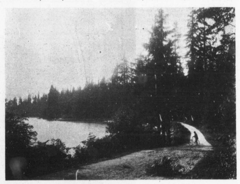
A DRIVE IN STANLEY PARK, VANCOUVER, B.C.

Eighty miles up the bay from Victoria is Vancouver, another of the outposts of empire. Vancouver is a wide-awake, hustling, progressive place, full to overflowing with that American vim which, rightly directed, makes for fine municipal progress; wrongly turned, heads toward bursted booms. I went to church in Vancouver one night and I would hardly have known that I was not in some American city church on the eve of a municipal election, with some daring preacher uncovering a municipal receptacle with the scent of sulphur below its bed. He did not seem a sensational preacher; rather, I should say, a serious, matter-of-fact one, and yet stirred to his depths because of the prevalence