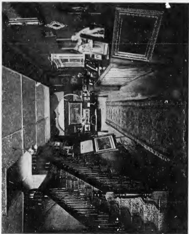
Roberts' Art Galleries, 79 King Street West.

T with gen of pre of kn ho co th o be va w y