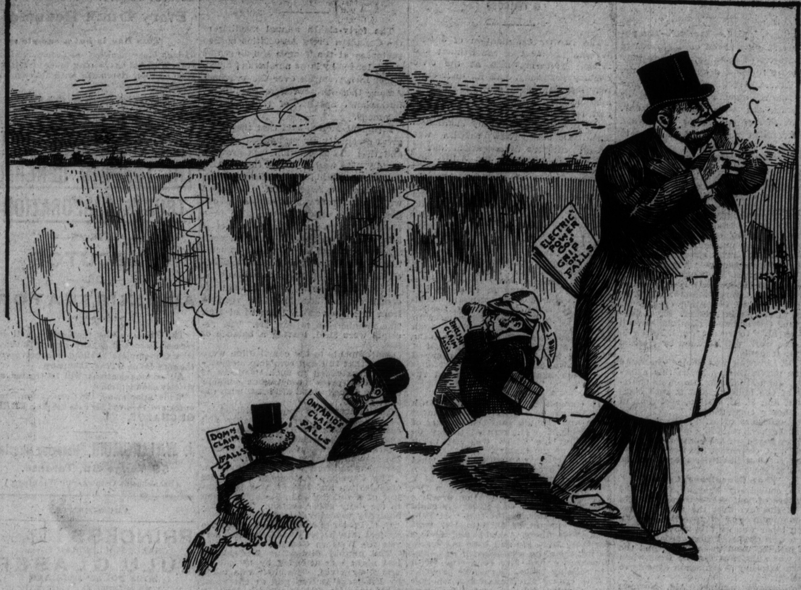
MR. BIG CORPORATION: Say, it's funny to hear that bunch disputing as to which one of 'em owns the Falls.