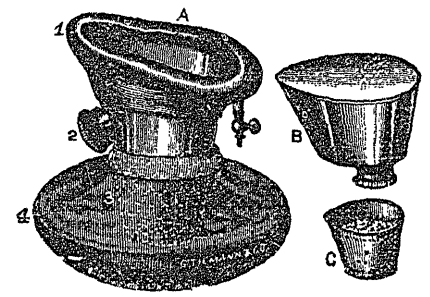
A. Inhaler ready for use. B. Ether reservoir. C. Ether measure, showing sponge inside. 1. Air cushion, inflated. 2. Air cap. 3. Wire net basket to contain sponge. 4. Rubber bag collapsed.

AN IMPROVED ETHER INHALER.—In presenting this apparatus to the notice of the profession, I wish at the outset to disclaim any idea of misappropriation. The instrument is in principle identical with Ormsby's inhaler, the best points of which have been utilized. A practical experience of some nine years with the original apparatus has induced me to modify it, so that a compact, efficient and inexpensive inhaler could be obtained by any practitioner. The improvements are the substitution of rigid, instead of flexible metal in the face piece; the omission of the ether supply tubes, and the modification of minor details throughout.