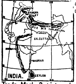
Trade Mark Registered