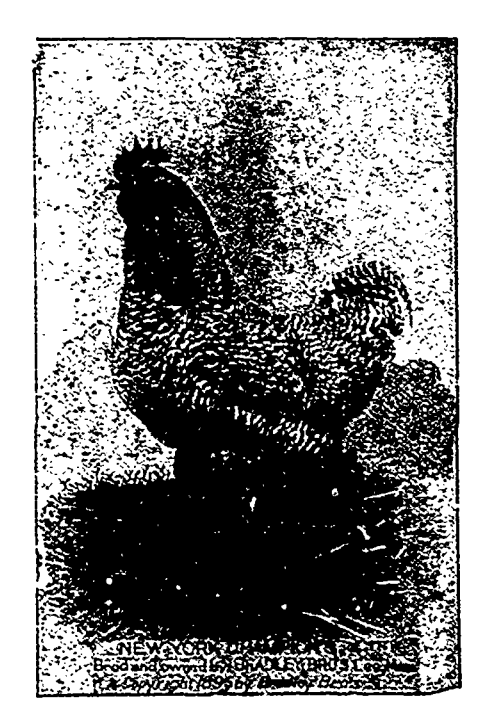
NEW YORK CHAMPION'S 4TH,

Weight 9½ pounds as cockerel, was sired by the first prize New York cock 1894. His grandstre on dam's side was Madison Boy, the first pen male at New York in 1892. Four of the seven immediate male ancesters were first prize New York winners.