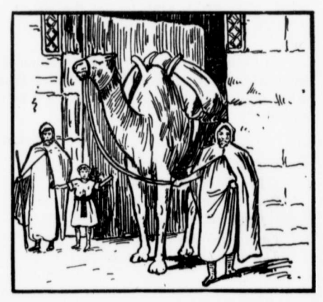
Only, our Saviour was born in a much poorer place than this : it was in the stable of the inn. Color the picture.

What is this strange looking place? It is an inn like the one in which Jesus was born.