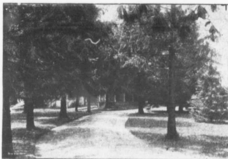
Entrance to Grounds.