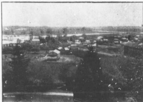
Grand River from College Tower.