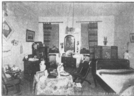
A Teacher's Bedroom.

Day pupils may have the use of a piano for practice at the rate of $2 00 for one hour per day during the term. In the case of parties in the city who are obliged to rent pianos, this will be found a very convenient and inexpensive arrangement.