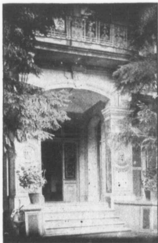
Main Entrance to College.