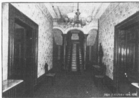
Hall and Leading Stairway.

All lights in the bedrooms are to be extinguished at 9:45 p.m.