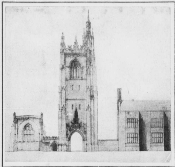
Preliminary Sketch of Proposed Memorial