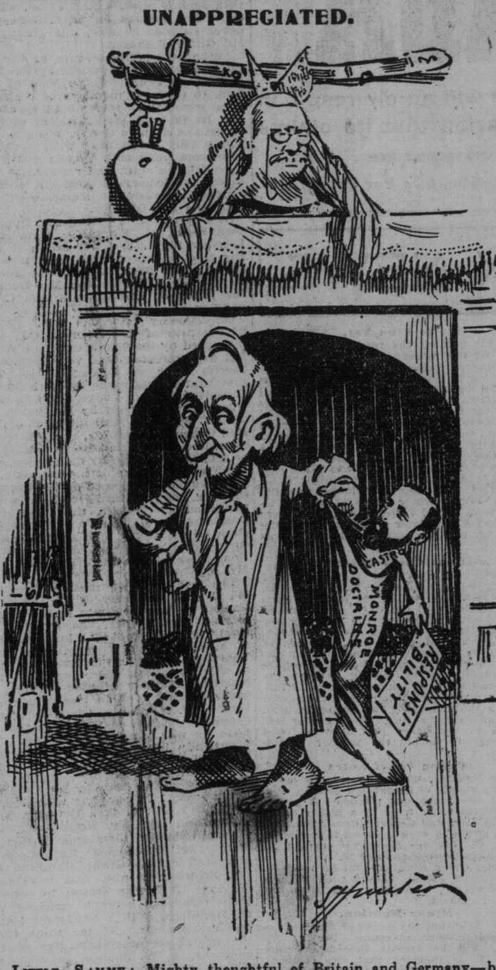
LITTLE SAMMY: Mighty thoughtful of Britain and Germany—but I think I could've spent a purty merry Yuletide without this in my stocking.