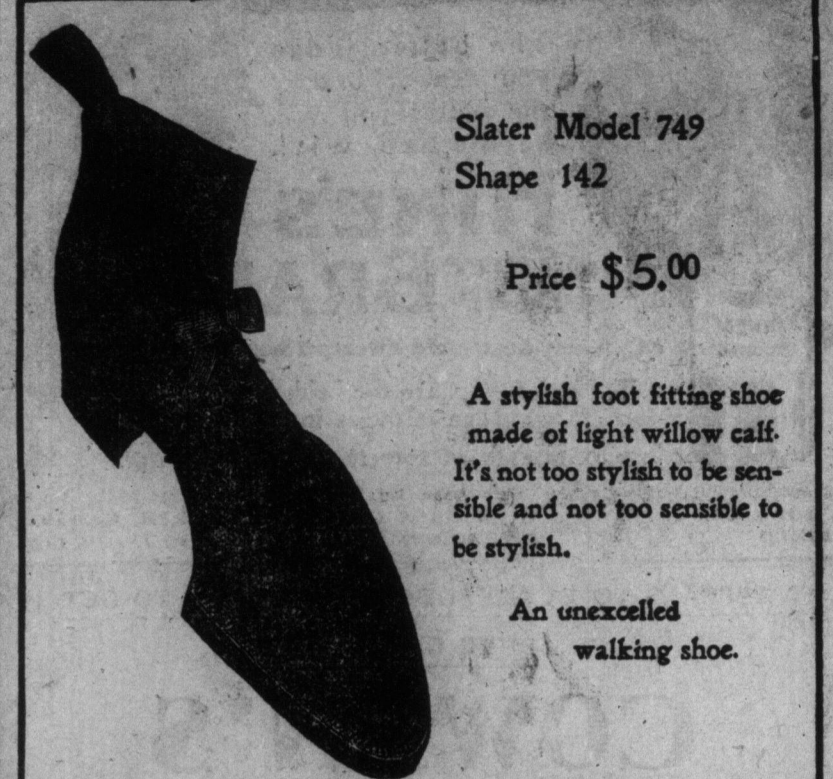
Slater Model 749 Shape 142 Price $5.00

IRON WORKS LIMITED TORONTO BUILDERS PEERS AND BOILERMAKERS REFINED OILS LUBRICATING OILS GREASES