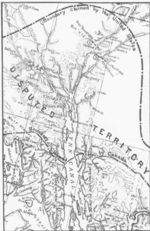
MAP SHOWING THE DIFFERENT LINES OF BOUNDARY CLAIMED BY THE UNITED STATES AND CANADA ABOUT LYNN CANAL.

The numerals (1), (2), and (3) above Lynn Canal indicate the Provisional Boundary lines arranged between the United States and Great Britain in October, 1899. They are about 20 miles from tide-water, and injuriously affect her privileges of passage and coasting trade within what are claimed as the upper, or British, territorial waters, and to and from the Pacific Ocean.