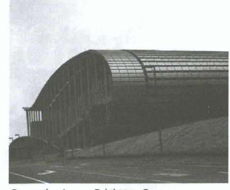
Guanazhou's new Exhibition Centre.

During the Trade Mission, participants met with the Canadian Consulate General trade team in Guanazhou. representatives of more than 40 companies and officials who traveled to Hong Kong to explore innovative partnerships potential in services, agri-food, transportation, education, information and communications, and biotechnology. Local experts also informed them about opportunities and challenges of doing business in the PRD. Companies benefitted from these meetings to develop and to explore new business opportunities in South China. Four partnership agreements were signed by Canadian companies and other ICT opportunities were pursued. These included public security needs of the 2010 Asian Games in Guangzhou, e-government with Guangzhou