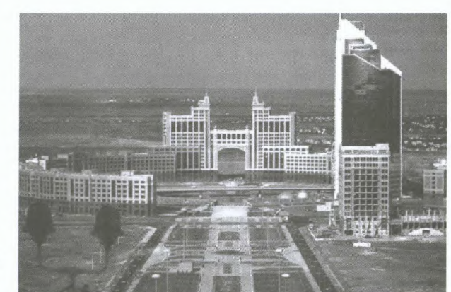
Government buildings in Kazakhstan's new booming capital, Astana.

Other areas of business opportunities include projects associated with the development of principal cities (Astana, Almaty, Atyrau)-construction, renovation, design & assembly, project management, turnkey projects—as well as projects associated with the country's infrastructure—upgrades, expansion or construction of new ports, airports, roads and power distribution grids. Advanced building materials, building automation controls, heating, ventilation