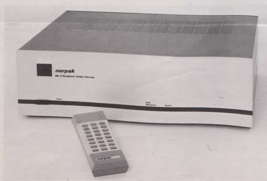
Norpak's broadcast teletext decoder. Currently CBC, CBS, NBC and Time Inc. offer teletext services that can all be displayed on Norpak teletext decoders.