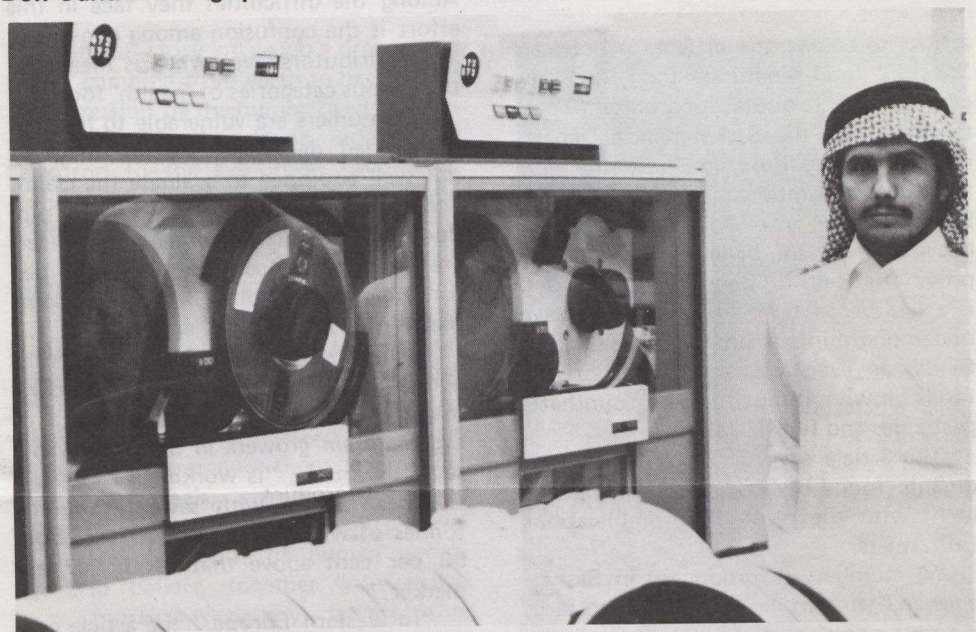
Computer systems have been a valuable aid in streamlining telecommunications administration at Saudi Telephone. The data processing centre, developed by Bell Canada International as part of its operations and management contract with the Saudi Ministry of Post, Telegraph and Telephone, is one of the largest and most advanced in the Middle East.

Despite the problems facing world economies, telecommunications continues to be an expanding industry; forecasts indicate that world telecommunications growth will be 7 per cent annually over the next four years compared to less than 3 per cent for world-wide general economic growth.