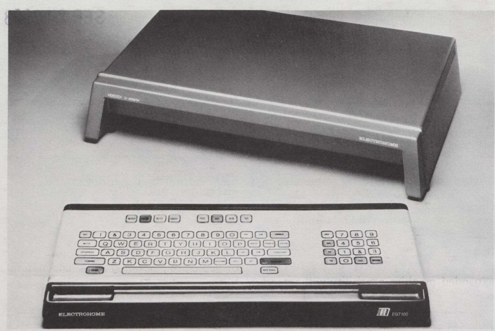
Electrohome's EGT 100 NAPLPS TV set adapter, with a built-in decoder and detachable keyboard. The unit operates with any television set to receive and display videotex information using a normal telephone line.

unveiled a prototype of a slick, small, TV-top terminal which, like cordless TV channel selectors, uses an infra-red light beam to signal from keypad to computer. The firm expects the $1 000-Telidon terminal to be available later this year.