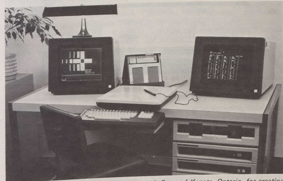
Information Provider System made by Norpak Corp. of Kanata, Ontario, for creating and editing pages, is one of the most popular systems in the world.

Videotex '83: sparkling showcase of Canadian high-tech products