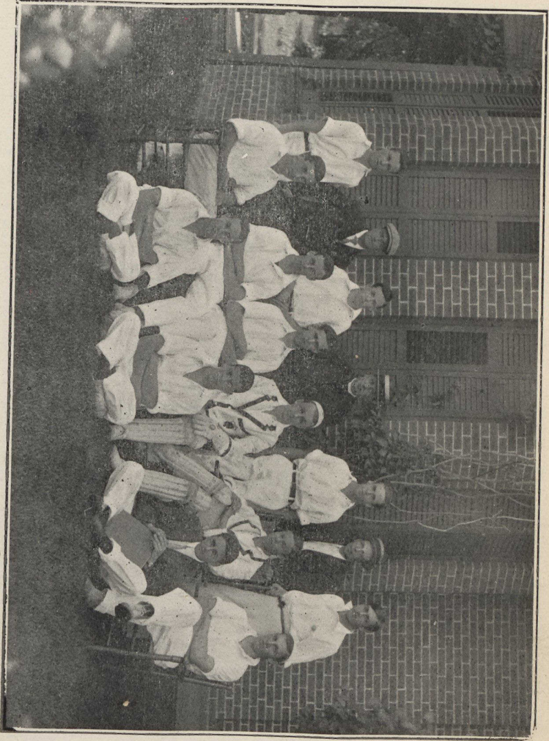
FIRST ELEVEN OF 1911.