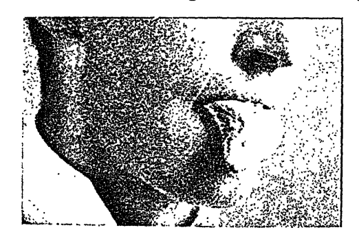
Fig. 2.

ing between sweet and sour, heat and cold) at the posterior third and anterior two-thirds of the tongue and that of ordinary tactile