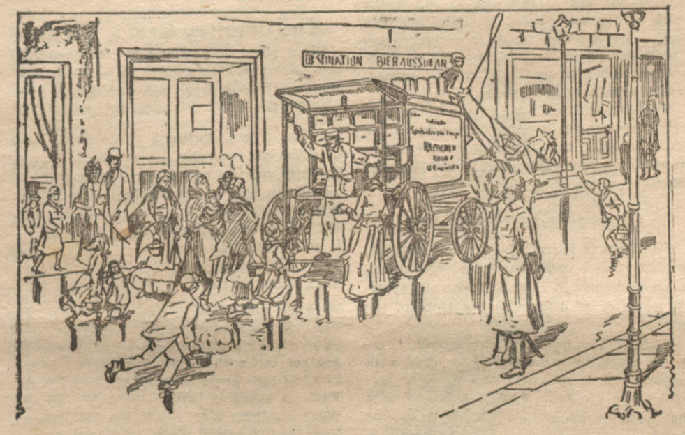
COLLECTING THE DINNERS IN BERLIN.

dinners and delivering them safely, punctually, and piping hot.