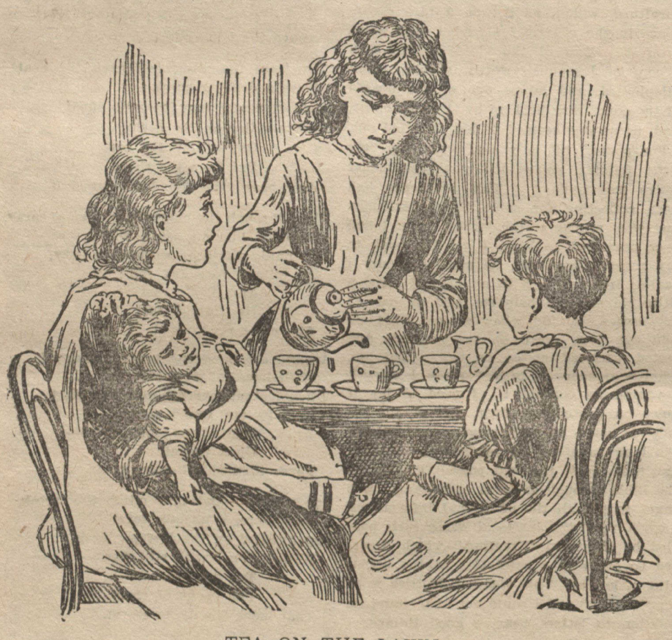
TEA ON THE LAWN.

ever so many things, Please let me stay.'