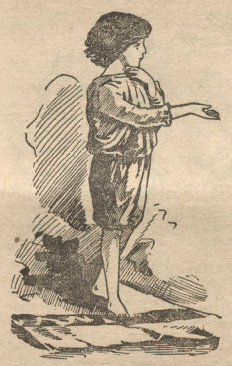
IT WAS THE WAY THEY BEGGED THEIR BREAD.

A smile broke out like light on the mother's face. She lifted her chin; the ac-