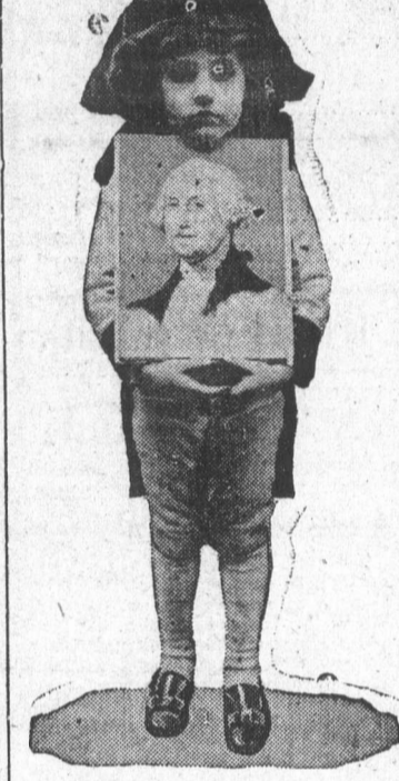
GEORGE WASHINGTON SUPPER FAVOR.

Below is a list of the receiving dames, dressed in Martha Washington