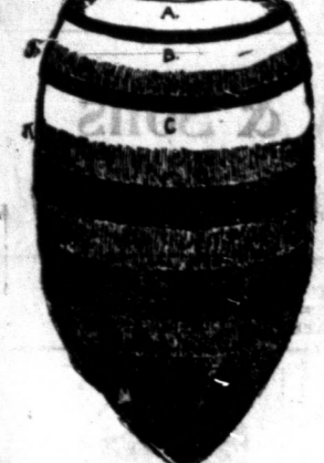
ABDOMEN OF WORKER BEE. See specimen as in the enlarged picture.

How to Recognize Them by the Markings of the Worker Bee. Those who are unacquainted with Italians are often desirous to know how they can be recognized.