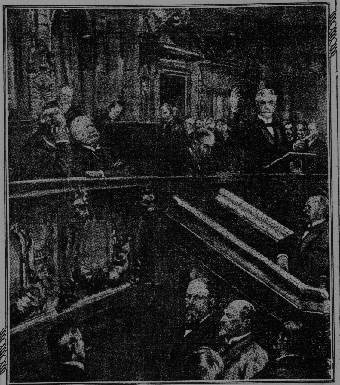
EMPEROR WILLIAM ATTACKED IN THE REICHSTAG.

Reichstag Criticizes Emperor of Germany.