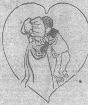
Fifty Years Ago.

No theory of germs to chill Affection's budding bilases; When ardent lovers took their fill. No microbes on their kinses. How happy they were not to know The germ-fad—po years ago.