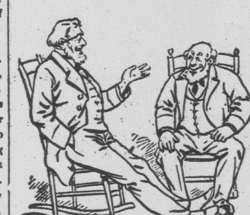
We old fellows can enjoy it as well as the younger ones.

Sept. 29th & 30th and 0ct. 1st You and I must go