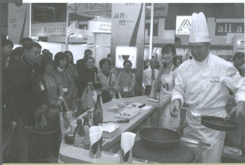
Leave them hungry for more: Trade shows can be great for business.

An exporter must know what to expect from a trade show prior to attending, and plan accordingly. Objectives will vary depending on the nature of the event. Researching relevant events is a logical point of departure. Organizers of these shows are usually pleased to send significant amounts of information to prospective exhibitors and attendees. This information might include the number of years the event has been hosted, attendance figures and the number of exhibitors. More see page 2 - Take your show on the road