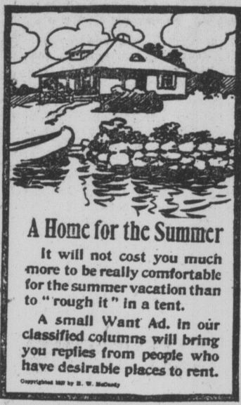
It will not cost you much more to be really comfortable for the summer vacation than to "rough it" in a tent.

As a preliminary to the adoption of any settled policy and in order that the Live Stock Commissioner may inform himself thoroughly as to the details of the sheep and wool trade in Great Britain and the United States and as to conditions as they actually prevail in Canada, the Minister of Agriculture has authorized the appointment of a committee of two competent men to investigate the sheep situation in general in the three countries named. At the same time, it is the expectation that without an actual visit, they will gather as much information as possible concerning the trade of the other great sheep producing countries in so far as it may be of interest in the development of the industry in Canada. It has been thought advisable to have this Committee consist of, in the first place, a wool expert whose special training has made him familiar with all the technical and practical phases of wool markets and wool manufacture in the United Kingdom and Canada and in the second place, a capable Canadian sheep breeder whose experience has given him a somewhat extended knowledge of sheep farming in this country. These gentlemen have already been appointed and are at present pursuing their investigations in Great Britain. The personnel of the Committee consists of Mr. W. T. Ritch, of Manchester, England, and of Mr. W. A. Dryden, of Brooklyn, Canada.