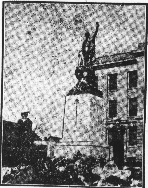
Photograph shows the war memorial that was unveiled at Sault Ste. Marie recently by Lord Byng.

MONTREAL. Oats—CW No. 2, 68¢; CW No. 3, 67¢; extra No. 1 feed, 65¢; No. 2 local white, 63¢. Flour—Man. spring wheat pats., 1sts, $7.80; 2nds, $7.30; strong bakers, $7.10; winter pats., choice, $5.90 to $6. Rolled oats, bag, 90 lbs., $3.55 to $3.65. Bran, $27.25. Shorts—$29.25. Middlings, $35.25. Hay—No. 2, per ton, car lots, $16.50 to $17. Cheese, finest wests., 17c; do, finest easts, 16½c to 16c. Butter—No. 1 pasteurized, 36 to 36¼c; do, No. 1 creamery, 34¢; do, seconds, 33¢. Eggs—Fresh extras, 42c; do, fresh firsts, 36c.