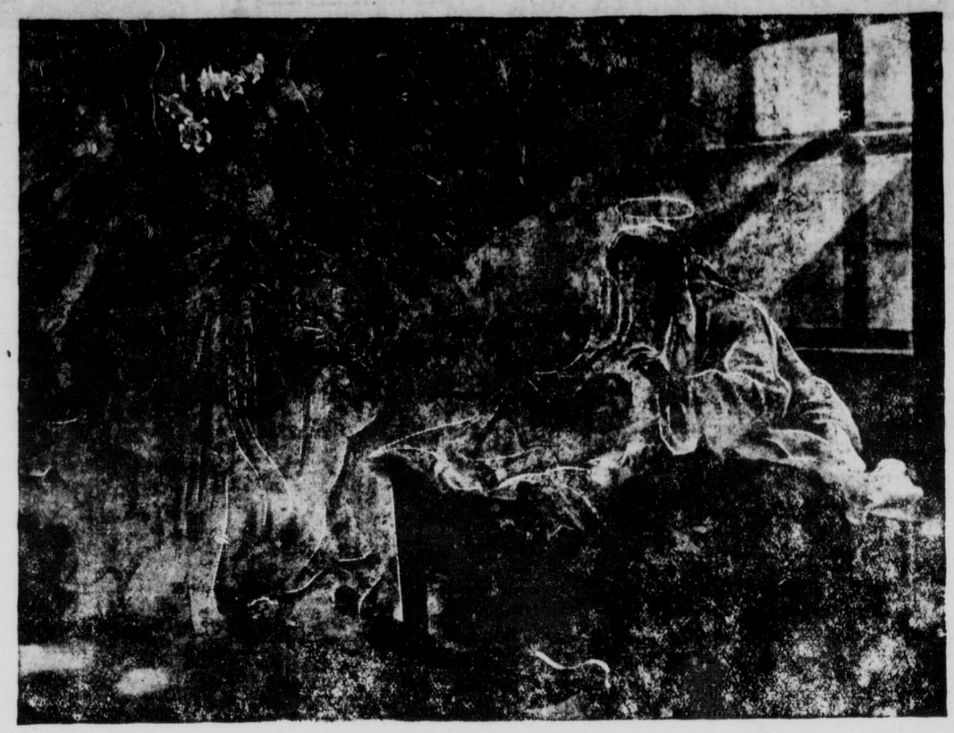
THE MORNING OF THE NATIVITY.

In England, in 1665, when the plague was raging, tobacco was re-garded as an excellent protection against infection,