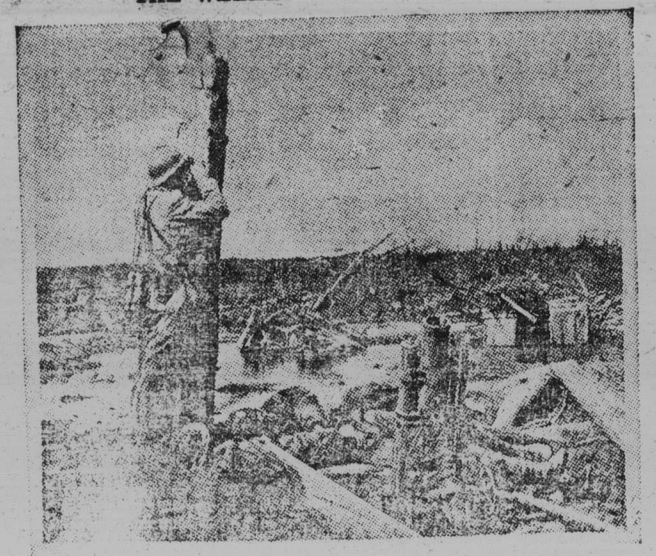
French officer examining the German lines in re-won Flanders.