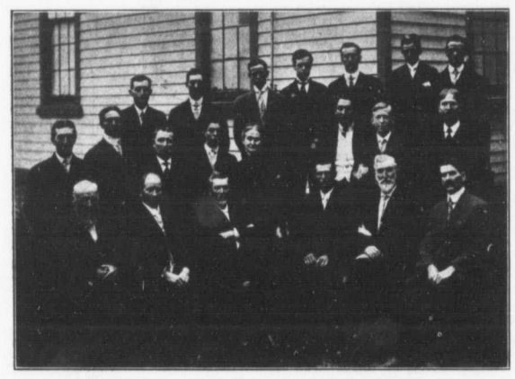
MEN'S ORGANIZED BIBLE CLASS, KING, ONT.

Not having accommodation in the body of the church, where the class had been meeting, a room in the basement was taken by the boys, painted and carpeted, and by the addition of a window was made and by the addition of a window was made bright and cheery. It was taken possession of amid great enthusiasm. The class grew until there were about thirty. on the roll, with a good average attendance. A series of special services were held in connection with the church during the winter following, and the majority of those who were not already Christians were converted. taking deeper interest in Bible study and thus becoming established in the good way. It was predicted that the class would not continue, but the members have taken the continue, but the memoers have taken the responsibility upon themselves, and though the first president moved away and the teacher also was removed, the class appointed others to take their places and still continues to have a large membership and maintains its interest in Bible study. The finances of the school have been augmented by the liberal contribution of two-thirds of class funds and other funds have not been overlooked.