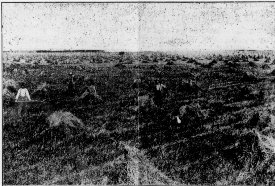
SCENE IN THE MELFORT DISTRICT

Small fruits—currants, gooseberries, raspberries, etc.—are grown to perfection; in fact all the above mentioned varieties grow wild, as well as strawberries, two varieties of cranberries, and blueberries; while in the Pasqua and Birch Hills hazel nuts are found in profusion. The fact of all