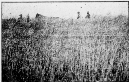
View showing Field of Wheat that averaged 49 bushels to the acre. - Melfort District

Published by The MELFORT BOARD OF TRADE MELFORT - SASK.