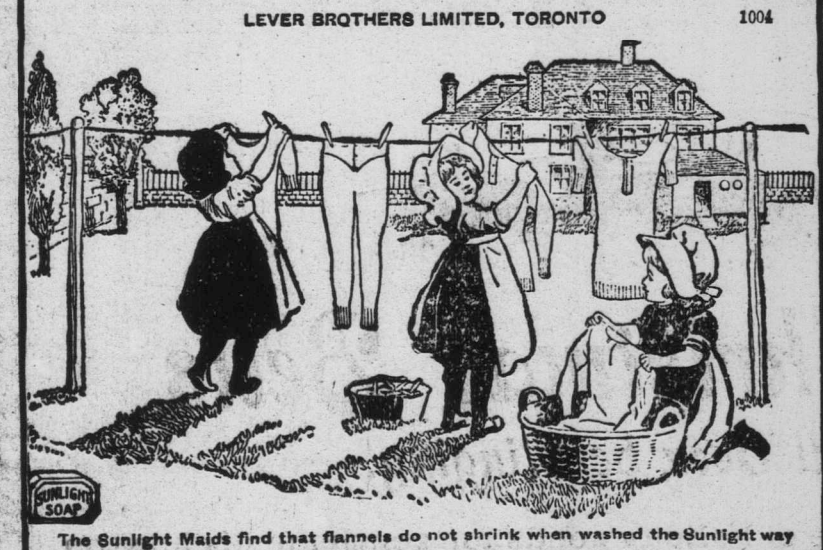
The Sunlight Males find that flannels do not shrink when washed the Sunlight way

Sunlight Soap contains no adulteration or excess alkali. It is just pure saponified fats and oils. That is why it cleanses your clothes perfectly in hard or soft water and does not injure them. All dealers are authorized to return your purchase money if you find any cause for complaint.