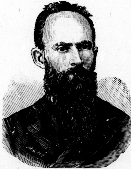
Rev. George Leslie Mackay, D.D. MISSIONARY AT TAMSUI, FORMOSA, SINCE 1872.