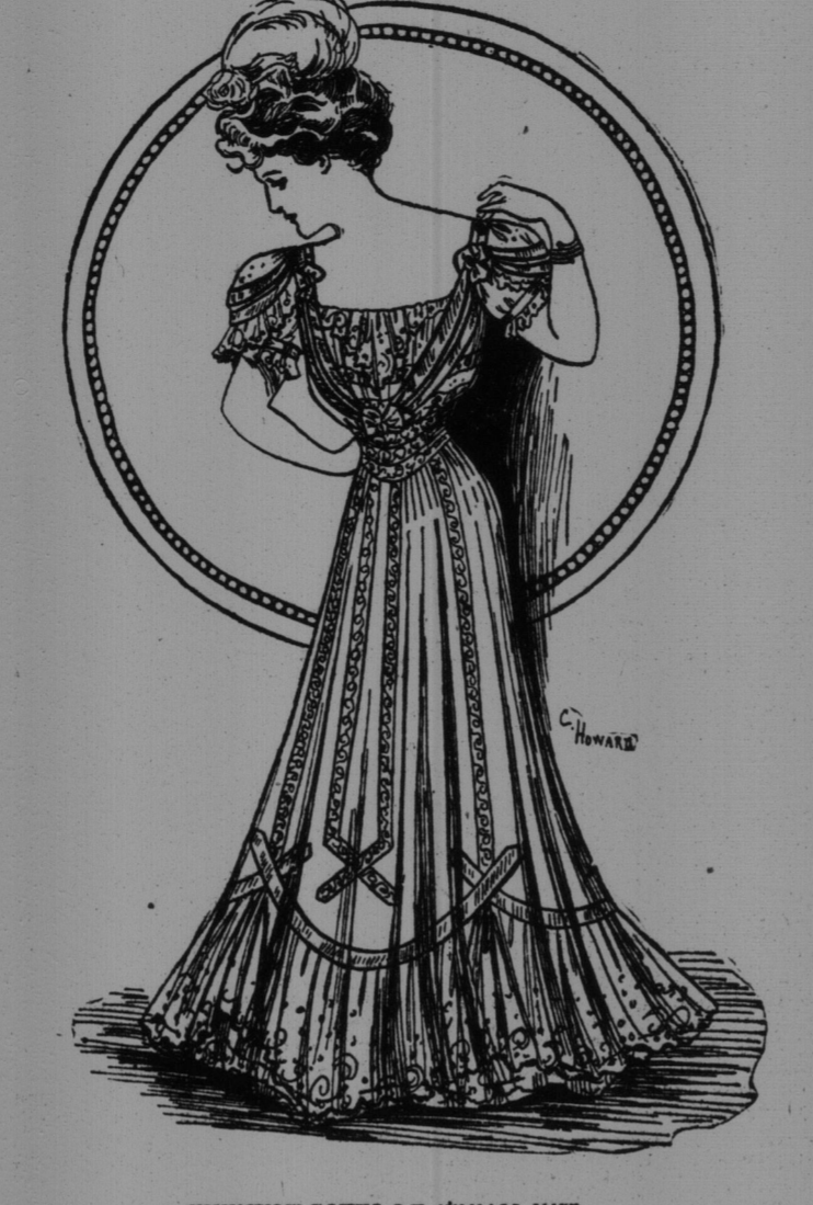
EVENING GOWN OF CREAM NET.

No Appetite Means loss of vitality, vigor or tone, and is often a precursor of prostrating sickness. This is why it is serious. The best thing you can do is to take the great alterative and tonic Hood's Sarsaparilla Which has cured thousands.