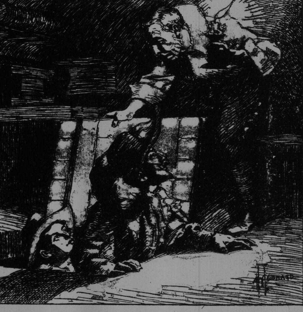
"He looked at us somewhat troubled or alarmed."

M. Etienne leaned his shoulder against the wall, smiling pleasantly, and waiting for the duke to make the next move. Mayenne kept a nonphased silence. The situation was indeed somewhat awkward. He could not come forward without encountering an agile opponent, whose exceeding skill with the sword was probably known to him. He could not turn tail, and his dignity allowed the course, with-