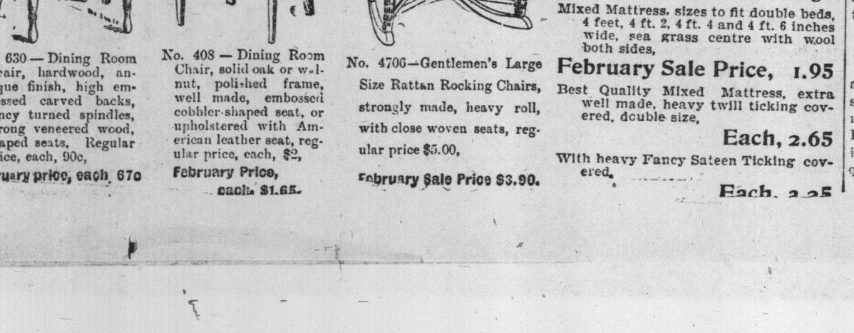
No. 630—Dining Room Chair, hardwood, antique finish, high embossed carved backs, fancy turned spindles, strong veneered wood, shaped seats. Regular price, each, 90c. February price, each, 67c