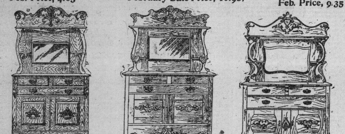
No. 48—Sideboard, Hardwood, Antique finish, neatly hand-carved and well finished. 85 inches high, 48 inches wide, 15x25 inch bevel plate mirror. Regular Price $11. February Sale Price, 8.38