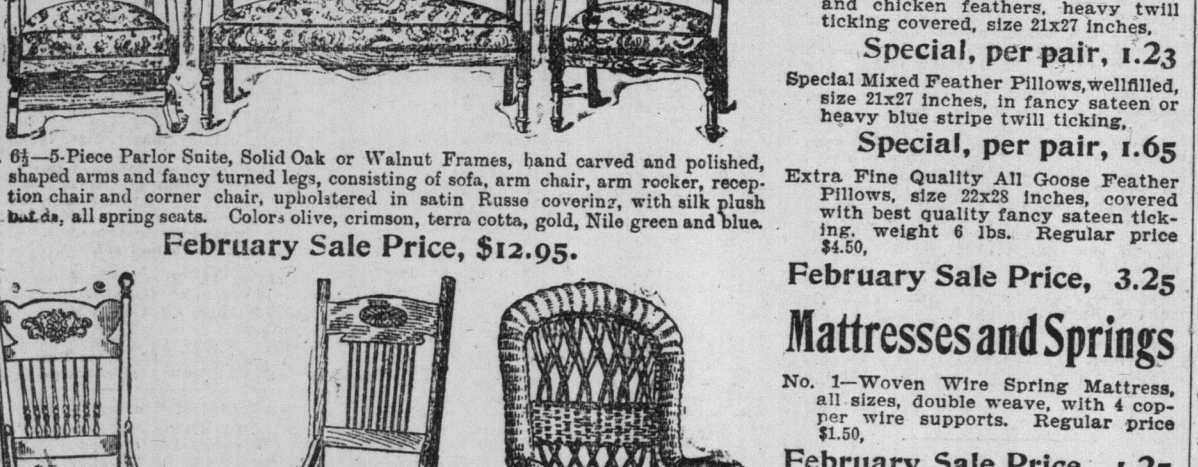
No. 61—5-Piece Parlor Suite, Solid Oak or Walnut Frames, hand carved and polished, shaped arms and fancy turned legs, consisting of sofa, arm rocker, reception chair and corner chair, upholstered in satin Russé covering, with silk plush backs, all spring seats. Colors—olive, crimson, terra cotta, gold, Nile green and blue. February Sale Price, $12.95.