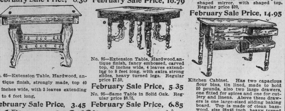
No. 65—Extension Table, Hardwood, antique finish, strongly made, top 40 inches wide, with 3 leaves extending to 6 feet long. February Sale Price, 3.45