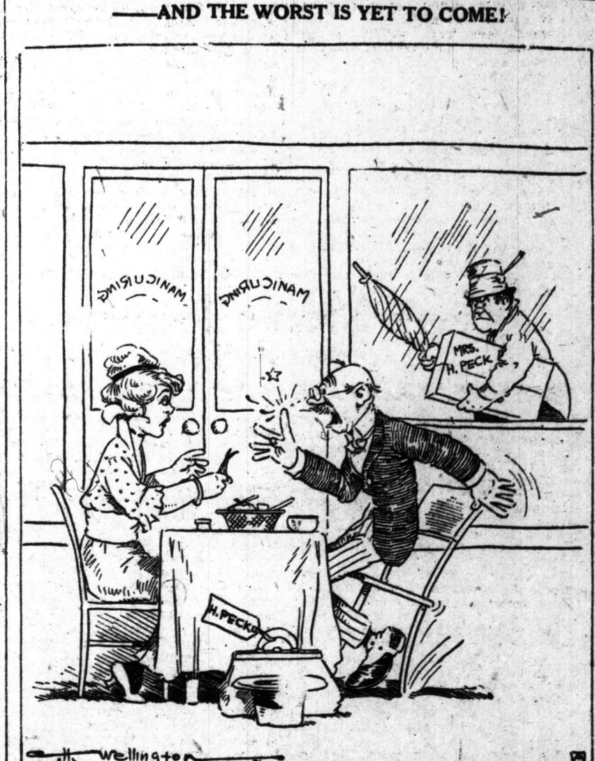
—AND THE WORST IS YET TO COME!